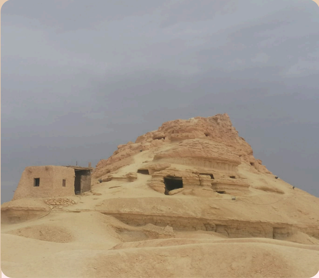
Mountain of Dead