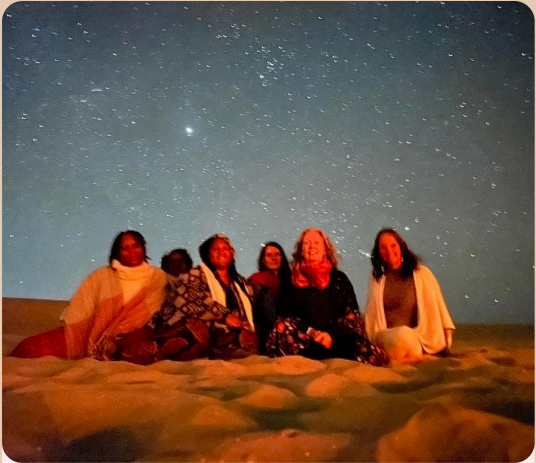
Desert and Skies