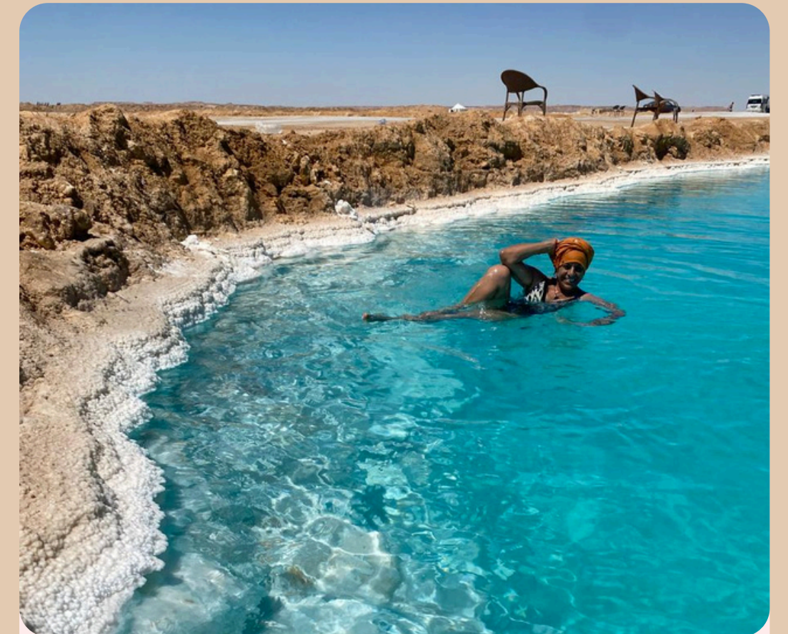
Natural Salt Pool