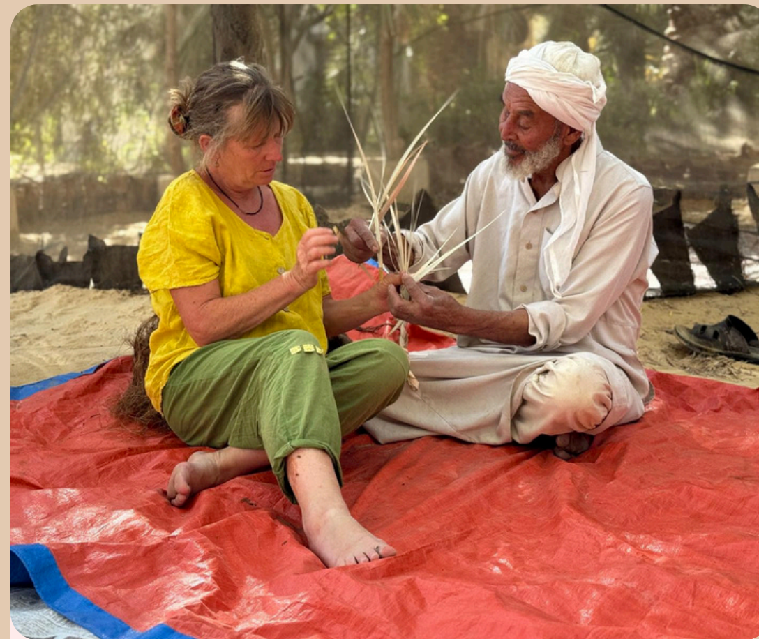
Crafts of Palms