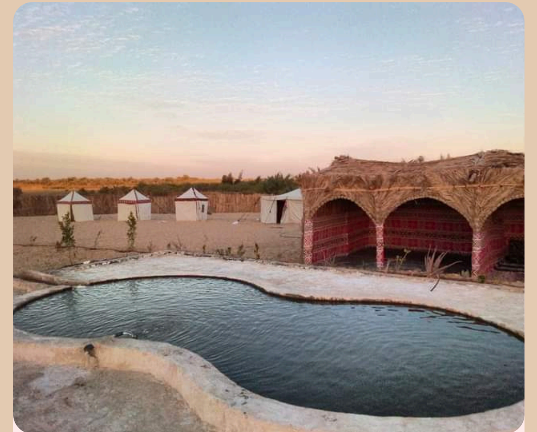
Hot Spring Water