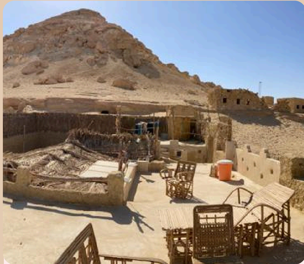
Siwa Kenz Mountain